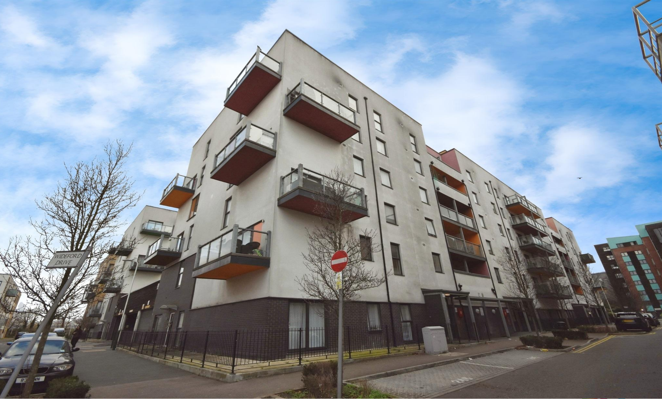
Priory Court, Wideford Drive, Romford, RM7 0FY