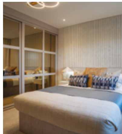
Each home at The Oaks has been designed to maximise light and space.

Synonymous with the quality of design and craftsmanship associated with all Allison Homes developments, all the houses at The Oaks benefit from a high standard specification.