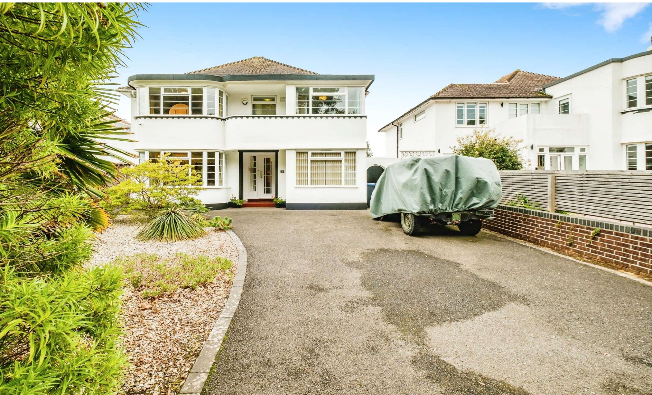
Sea Lane, Goring-By-Sea Worthing BN12 4QD