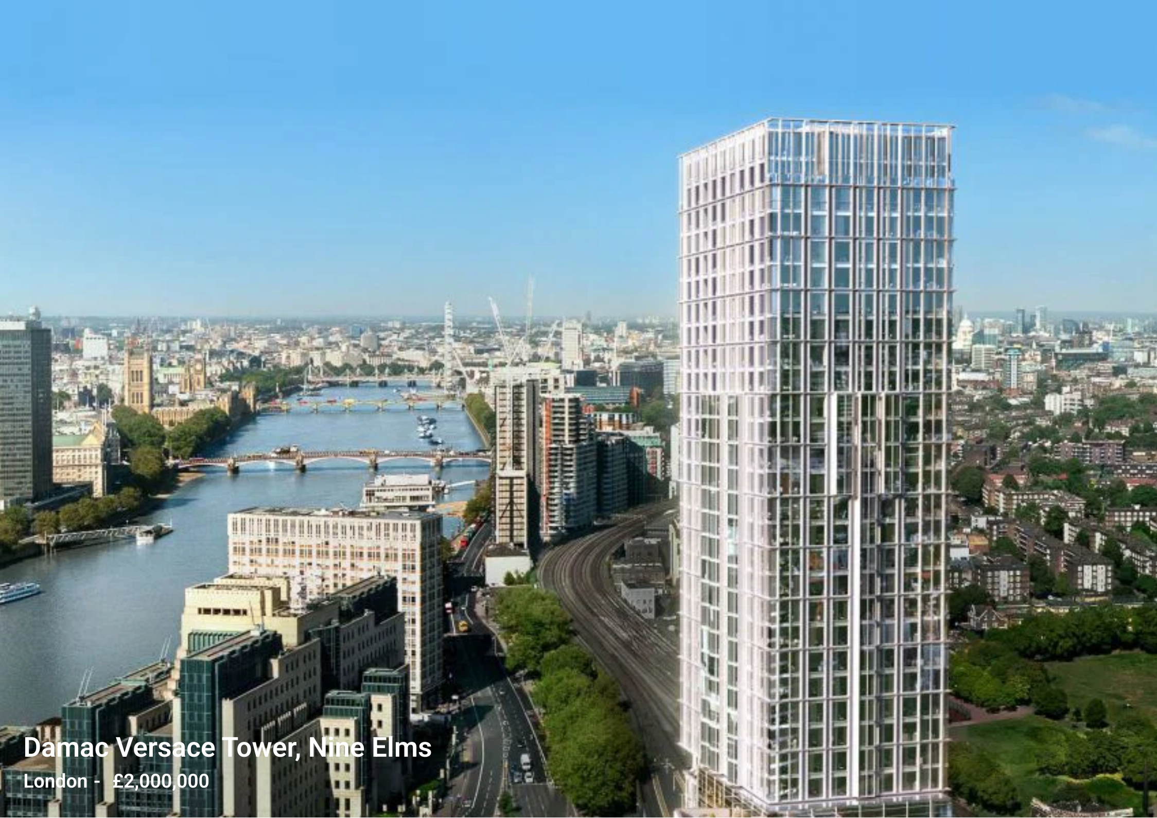
Damac Versace Tower, Nine Elms