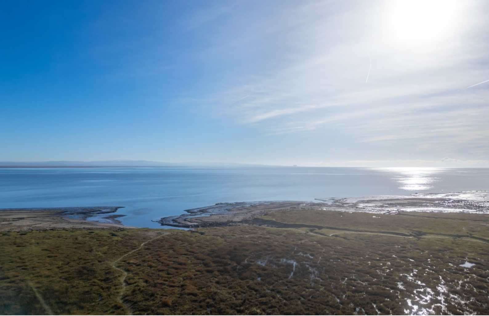
Heather Lea View