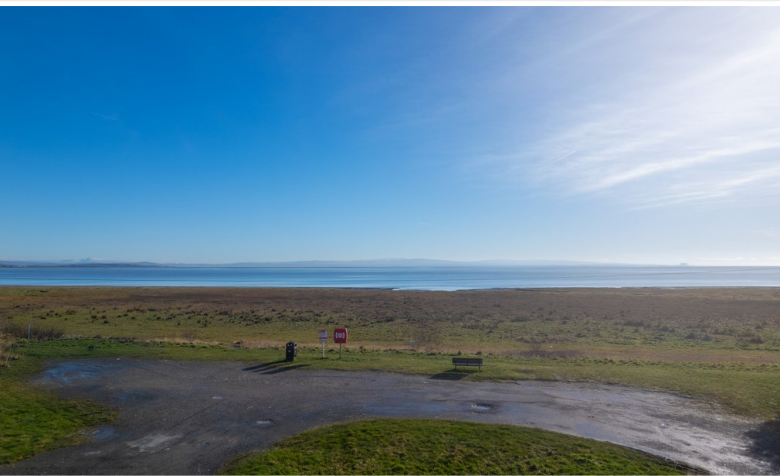
Heather Lea View