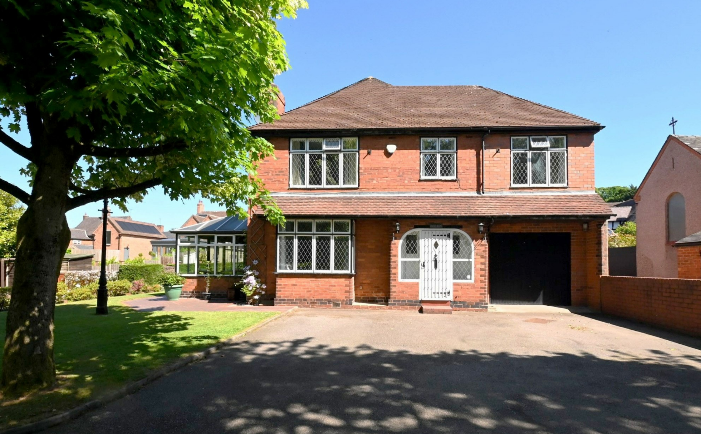
Davant House , Church Lane, Abbots Bromley, WS15 3DD