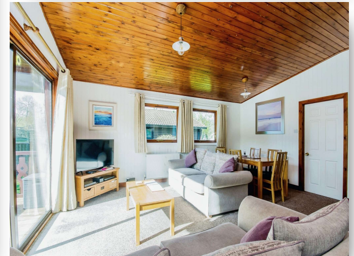
Duck Lagoon Sleaford Road, Tattershall Lincoln LN4 4LR