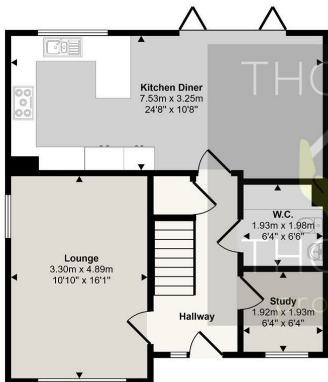
Ground Floor Approx 60 sq m / 645 sq ft

Approx Gross Internal Area 120 sq m / 1296 sq ft