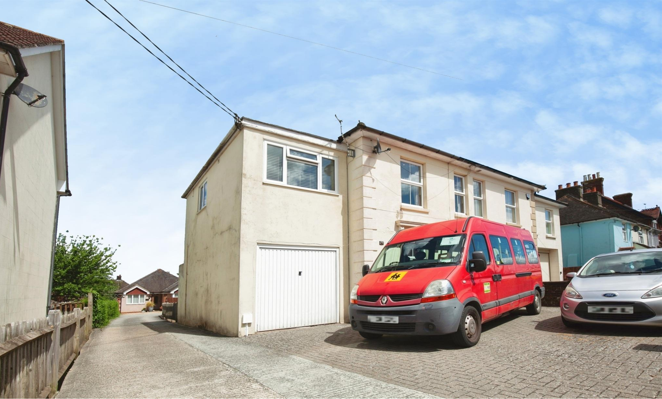
West Street, Burgess Hill, RH15 8NX