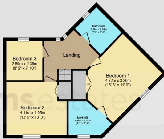
First Floor Floor area 57.0 sq.m. (614 sq.ft.)