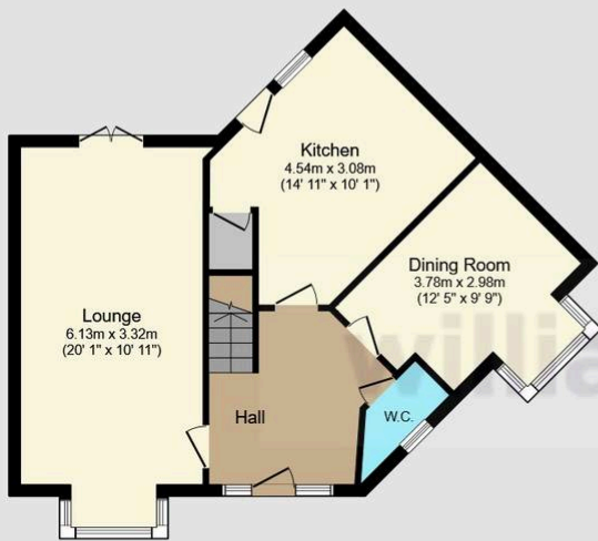
Ground Floor Floor area 59.5 sq.m. (641 sq.ft.)