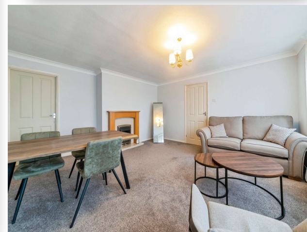
Bellmond Close, Newark NG24 4ER