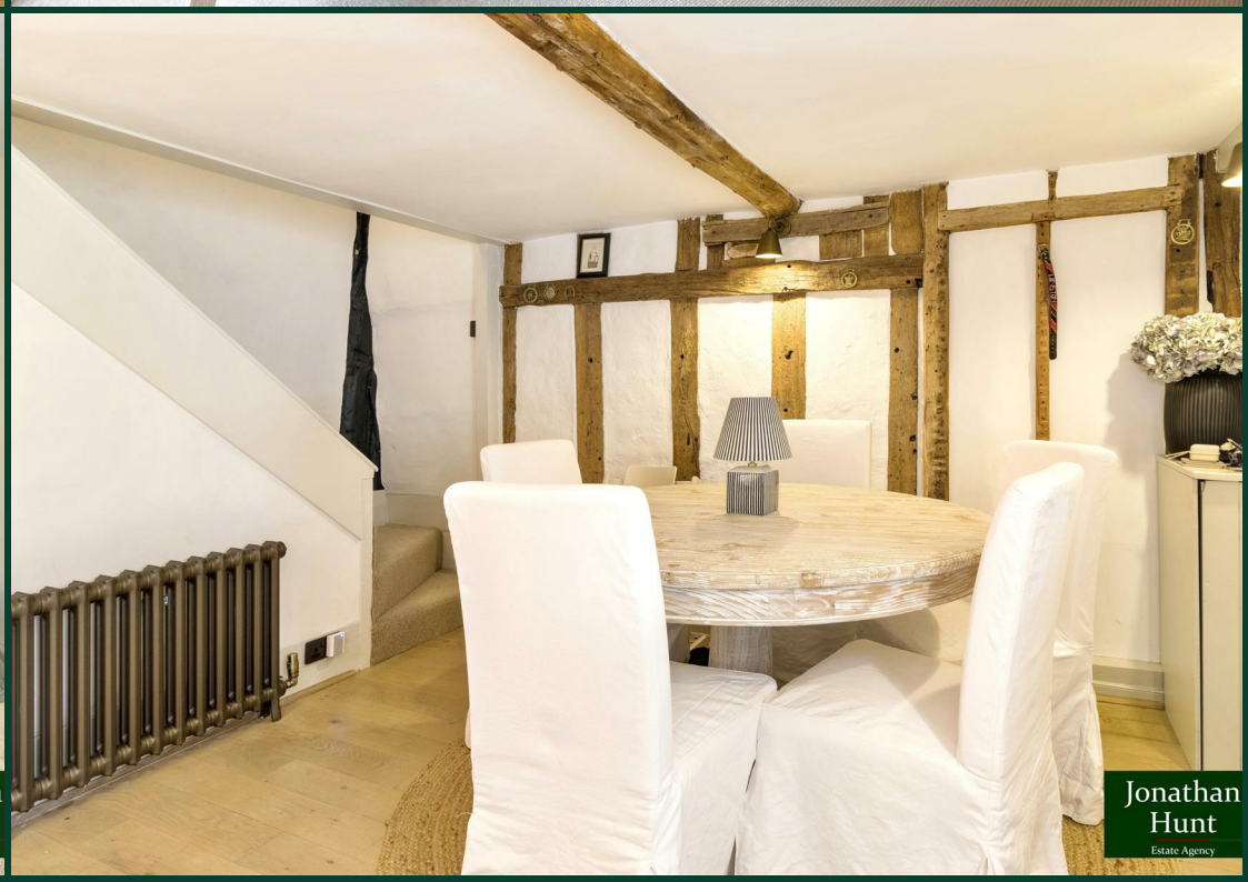
Jonathan Hunt Estate Agency