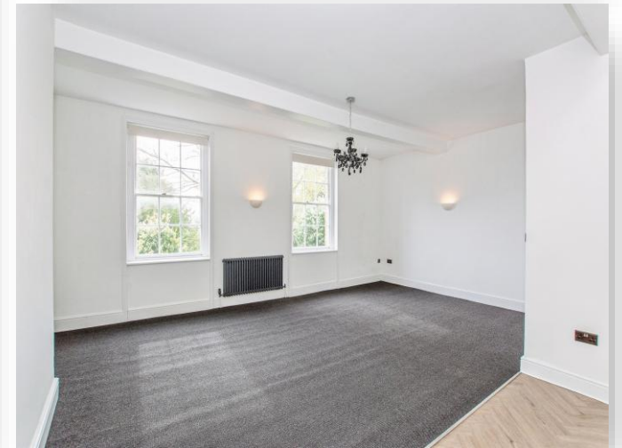
South Brink, Wisbech, PE13 1JQ