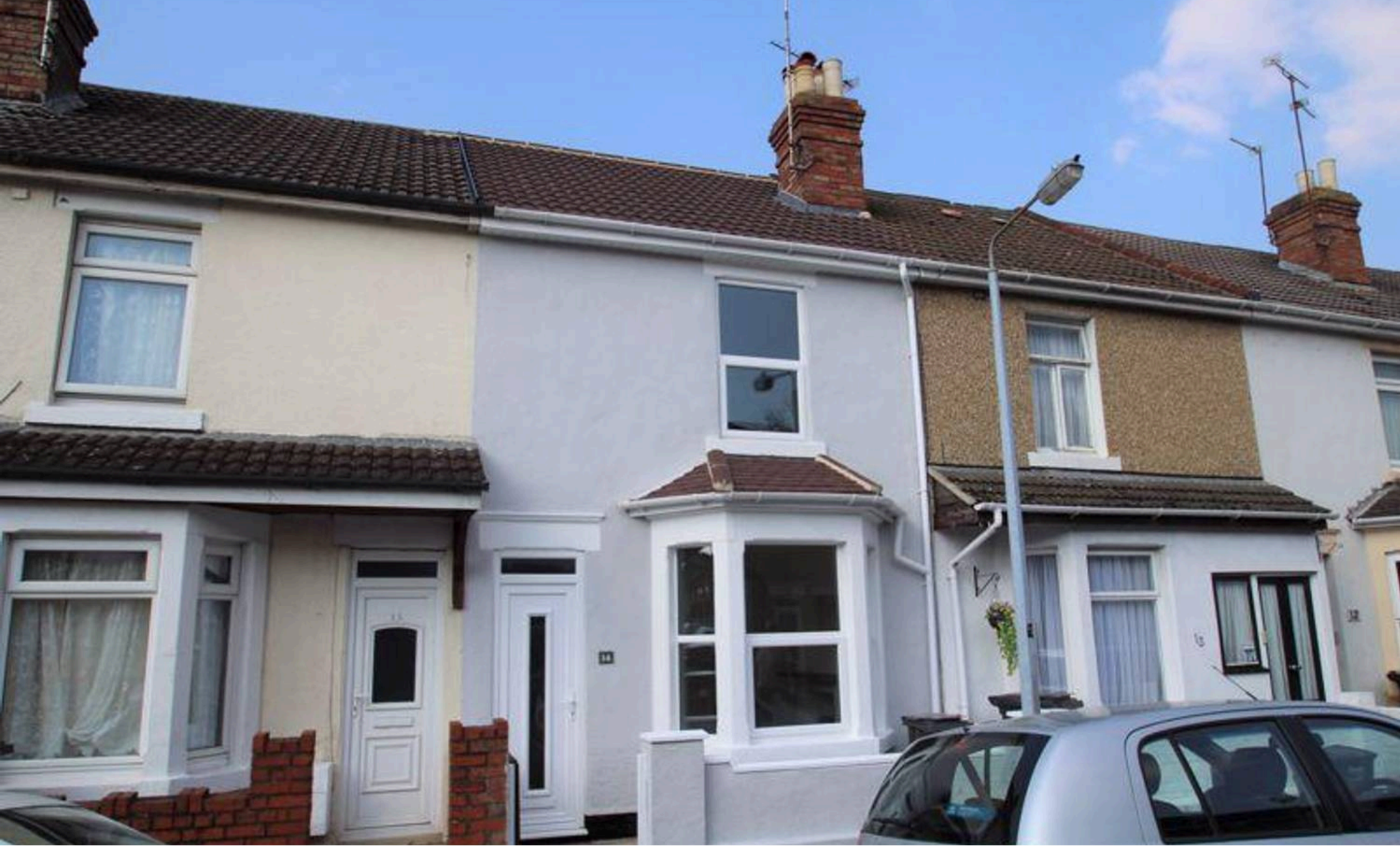
14 Ipswich Street, Swindon Swindon