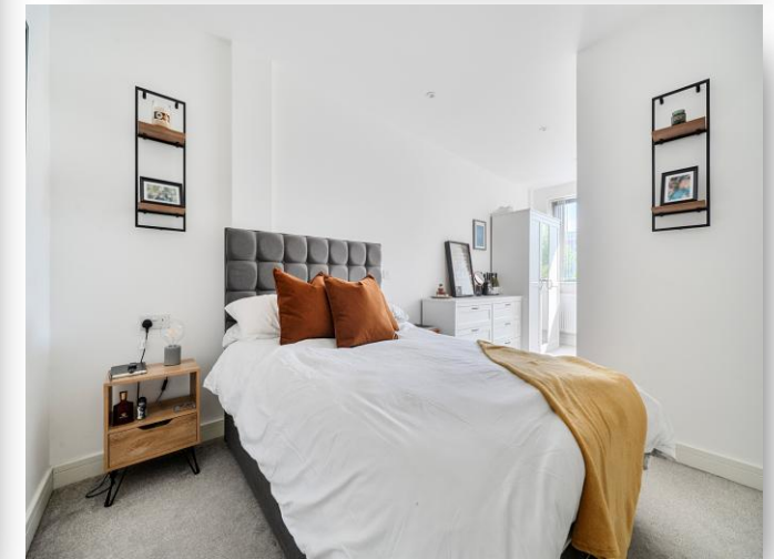
Flat 3 Maiden House, Vanwall Road, Maidenhead SL6 4FW