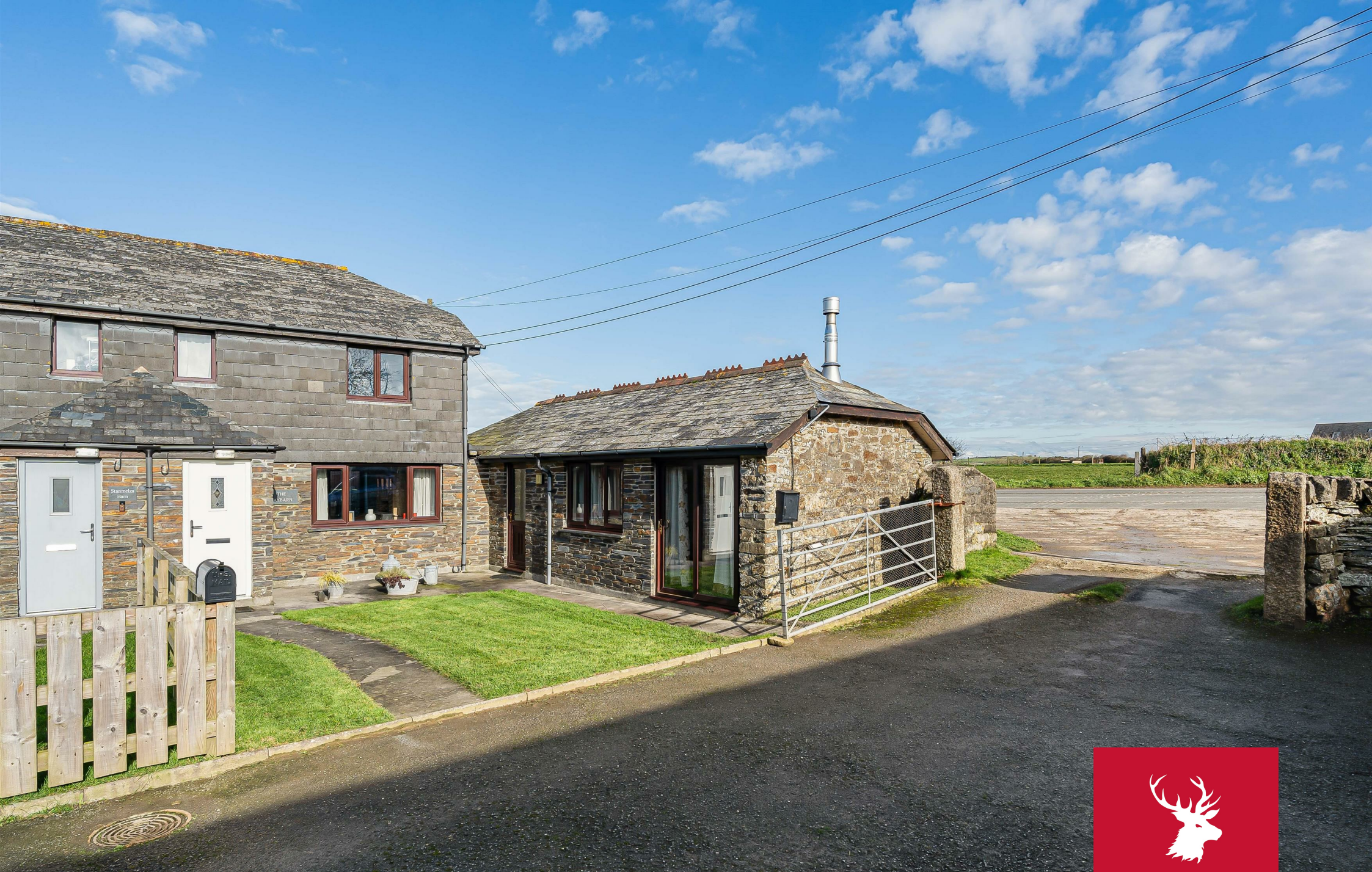
The Hay Barn