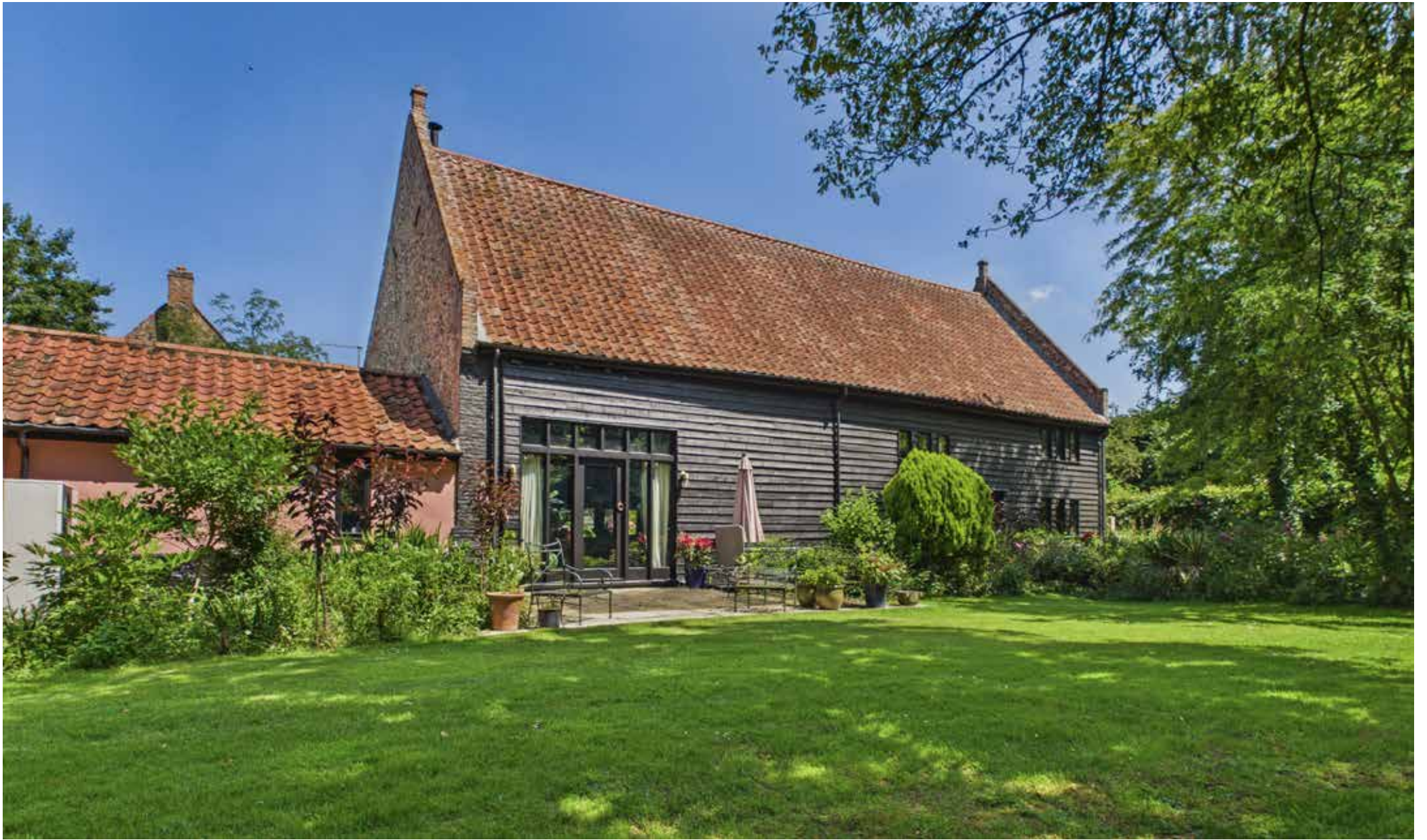
Barsham Barn Barsham | Suffolk | NR34 8HB