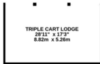
CART LODGE 498 sq.ft. (46.3 sq.m.) approx.

FLOOR AREA - HOUSE (EXCLUDING CART LODGE) : 3445 sq.ft. (320 sq.m.) approx. TOTAL FLOOR AREA : 3943 sq.ft. (366.3 sq.m.) approx.