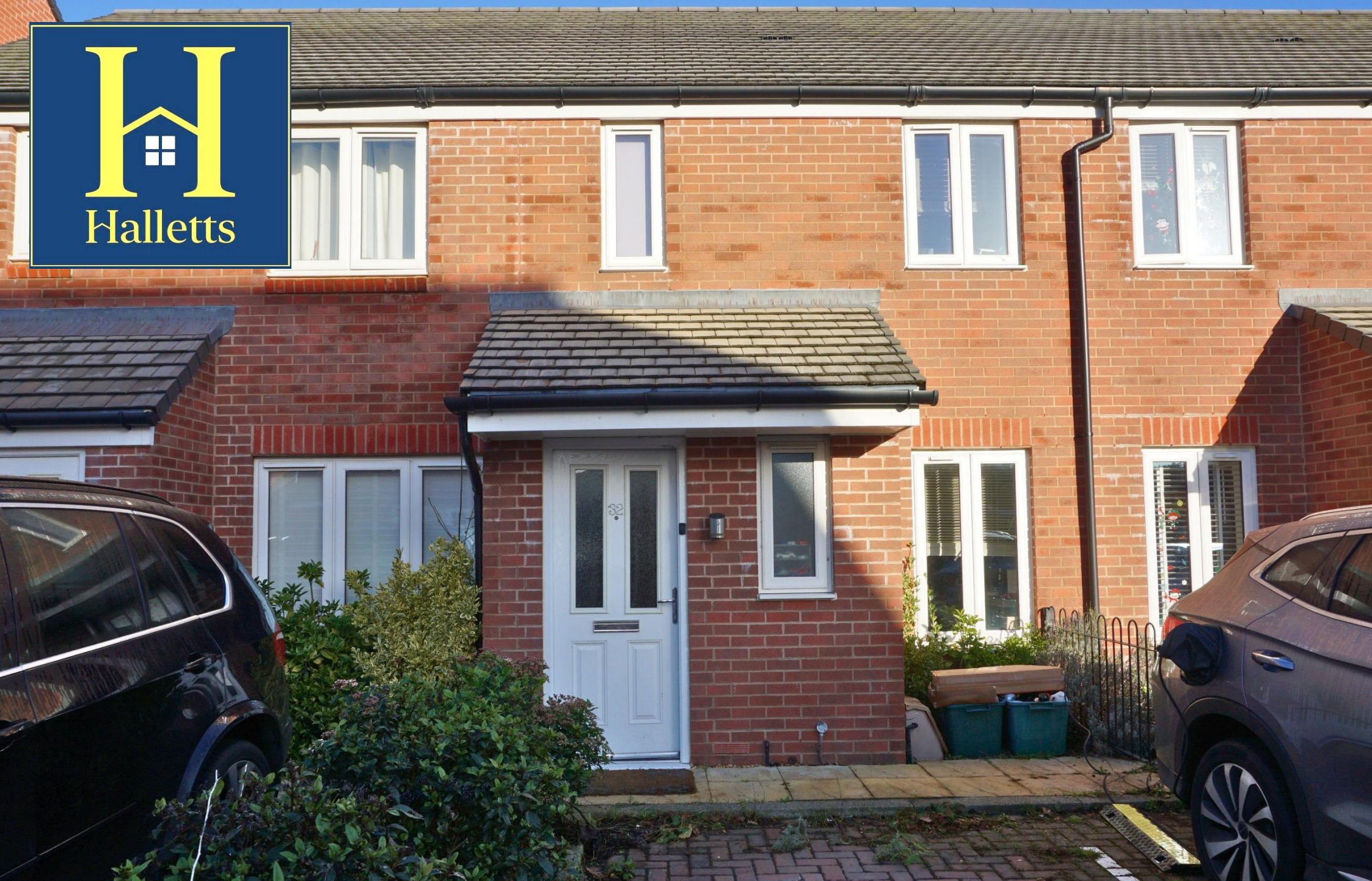
32 Roger Croft Drive Thatcham Berkshire RG19 3AD