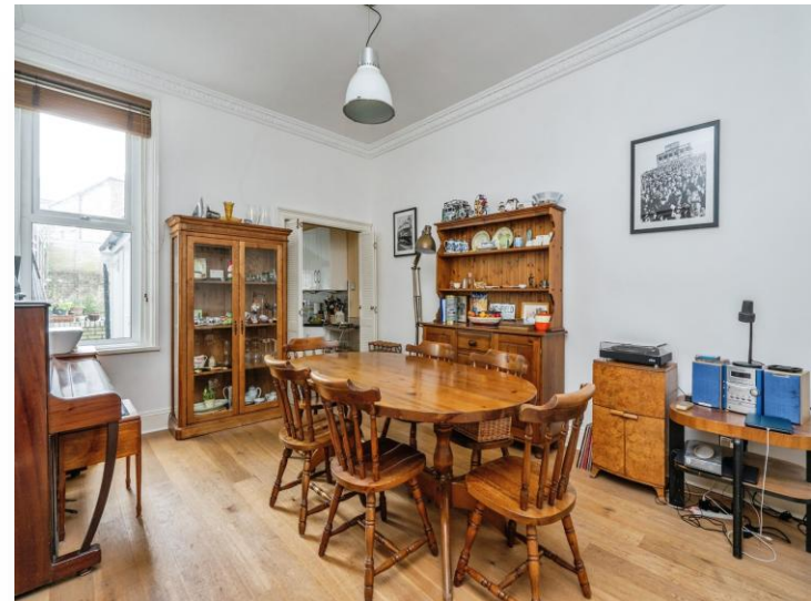
Brandon Road, Southsea PO5 2LY