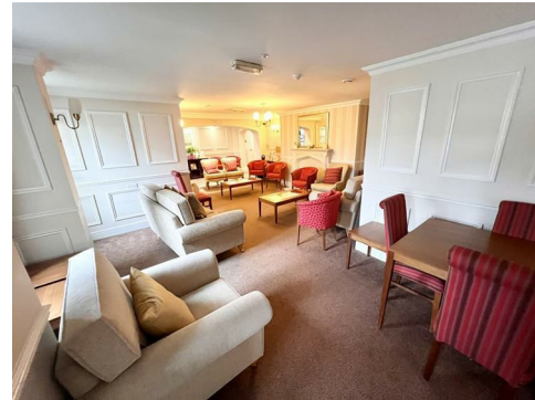
A great size communal space with kitchen facilities and a residents laundry