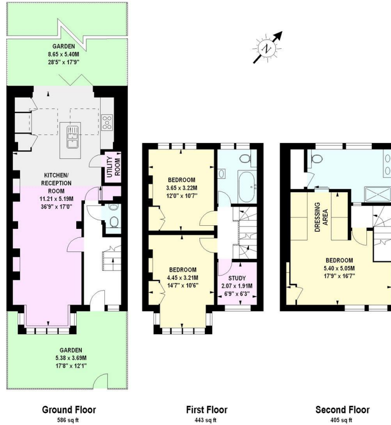
Illustration For Identification Purposes Only. Not To Scale *Floorplan Drawn According To RICS Guidelines

Chesterton UK Services Limited trading as Chestertons for themselves and for the vendor of this property whose agents they are, give notice that (i) these particulars do not constitute any part of an offer or contract, (ii) all statements contained within these particulars are made without responsibility on the part of Chestertons or the vendor, (iii) whilst made in good faith, none of the statements contained within these particulars are to be relied upon as a statement or representation of fact, (iv) any intending purchasers must satisfy themselves by inspection or otherwise as to the correctness of each of the statements contained within these particulars, (v) the vendor does not make or give either Chestertons or any person in their employment any authority to make or give representation or warranty whatsoever in relation to this property. Wide angle lenses may be used. ©Copyright Chestertons | Chesterton UK Services Limited | Registered Office 40 Connaught Street, Hyde Park, London W2 2AB Registered Company Number 05334580.