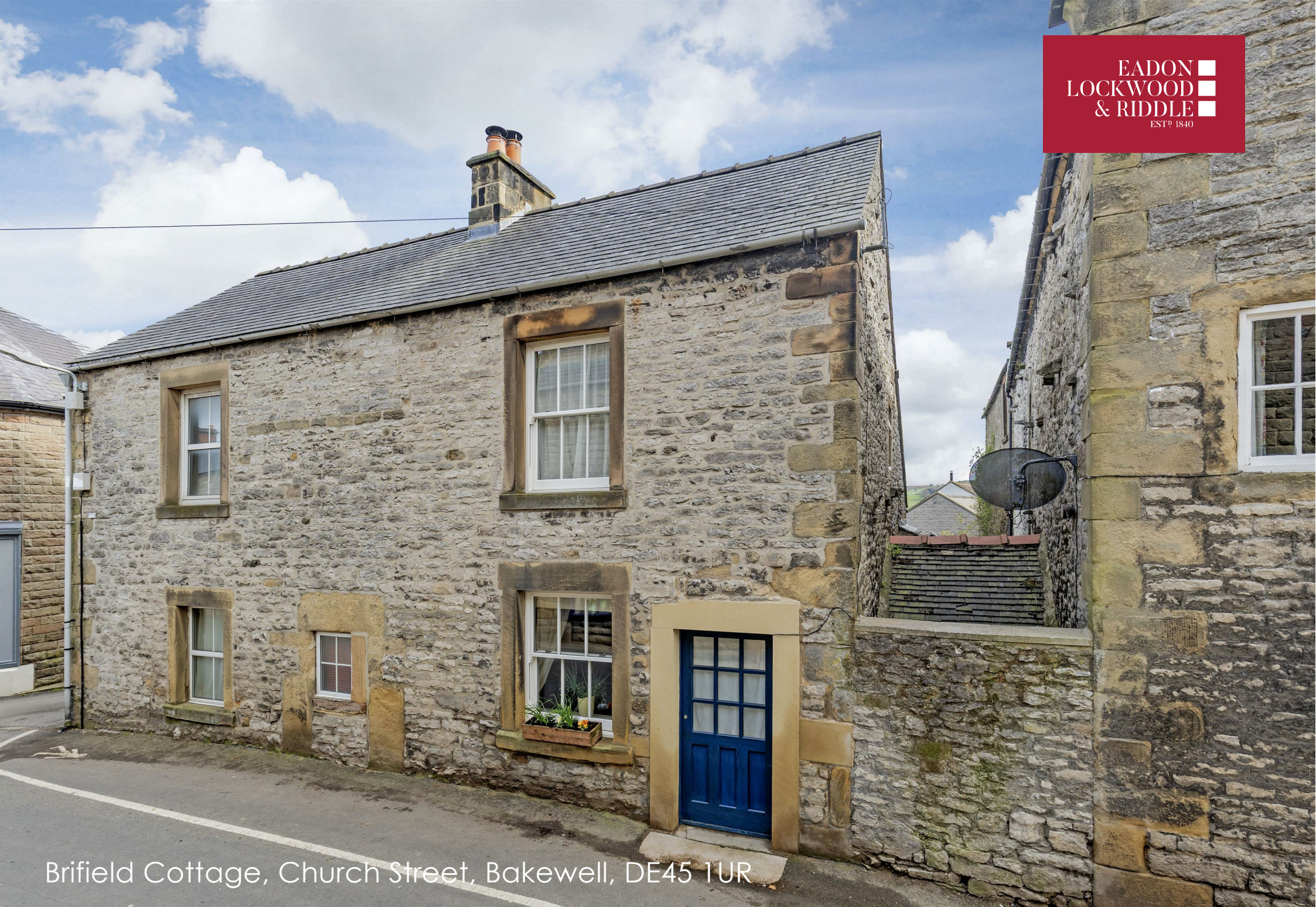
Brifield Cottage, Church Street, Bakewell, DE45 1UR