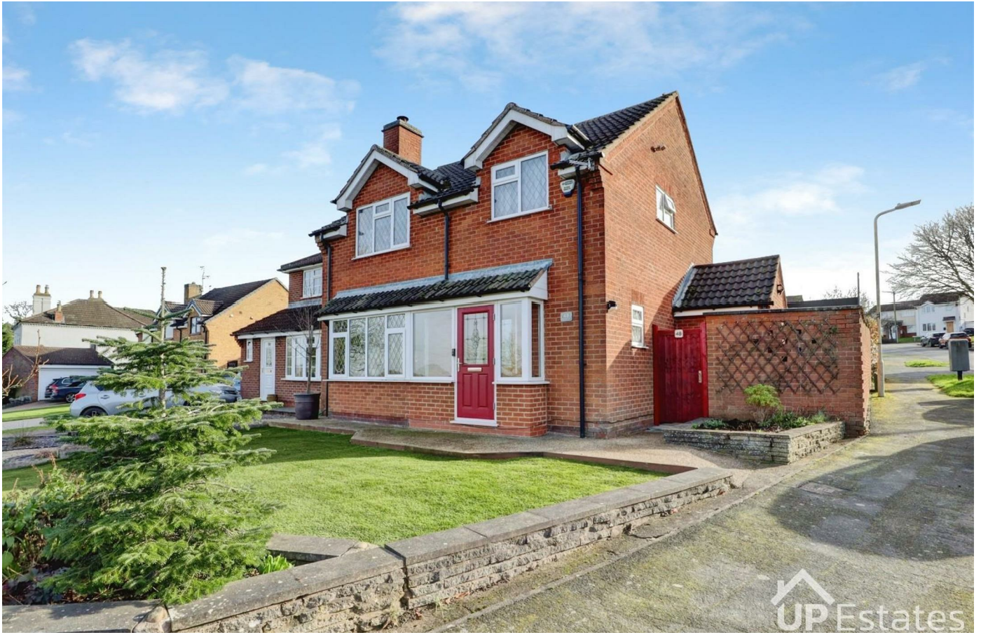
Thurlaston Lane, Earl Shilton, Leicester