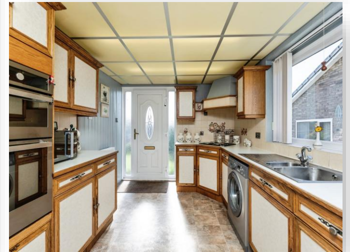
Ryedale Way, Tingley Wakefield WF3 1AJ