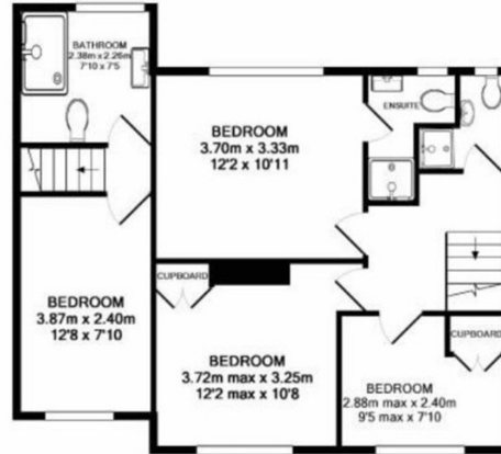
1ST FLOOR APPROX. FLOOR AREA 58.0 SQ.M. (625 SQ.FT.)

TOTAL APPROX. FLOOR AREA 155.4 SQ.M. (1673 SQ.FT.)