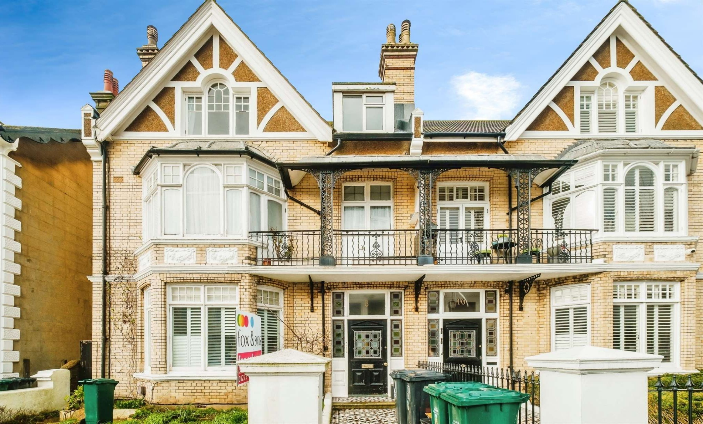
Sackville Gardens, Hove BN3 4GH