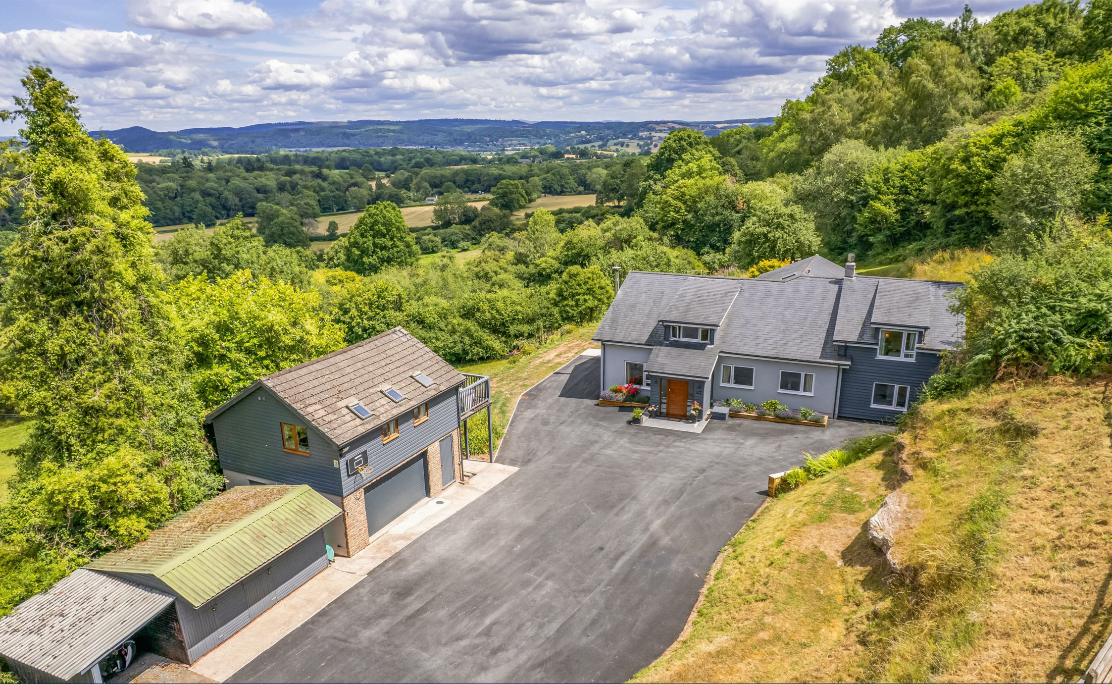
Woodlea Cottage Little Dewchurch, Hereford, HR2 6PS