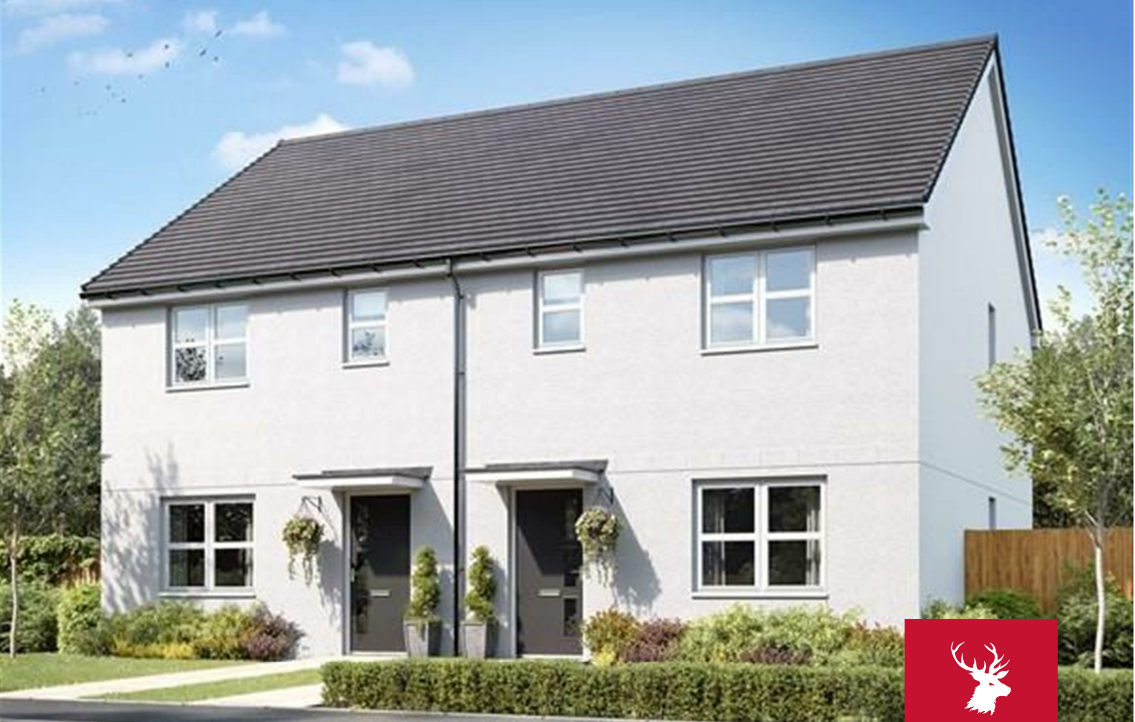
The Galloway, Plot 13