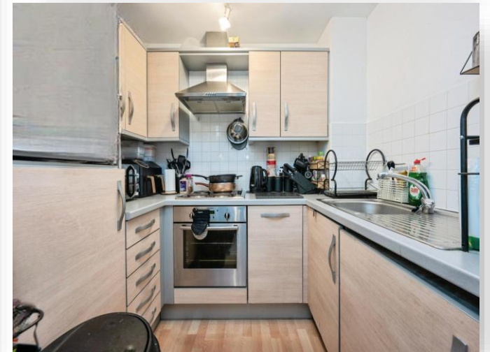
Magnon Court, Lake Street, Leighton Buzzard, LU7 1WB