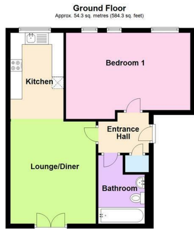
Total area: approx. 54.3 sq. metres (584.3 sq. feet)