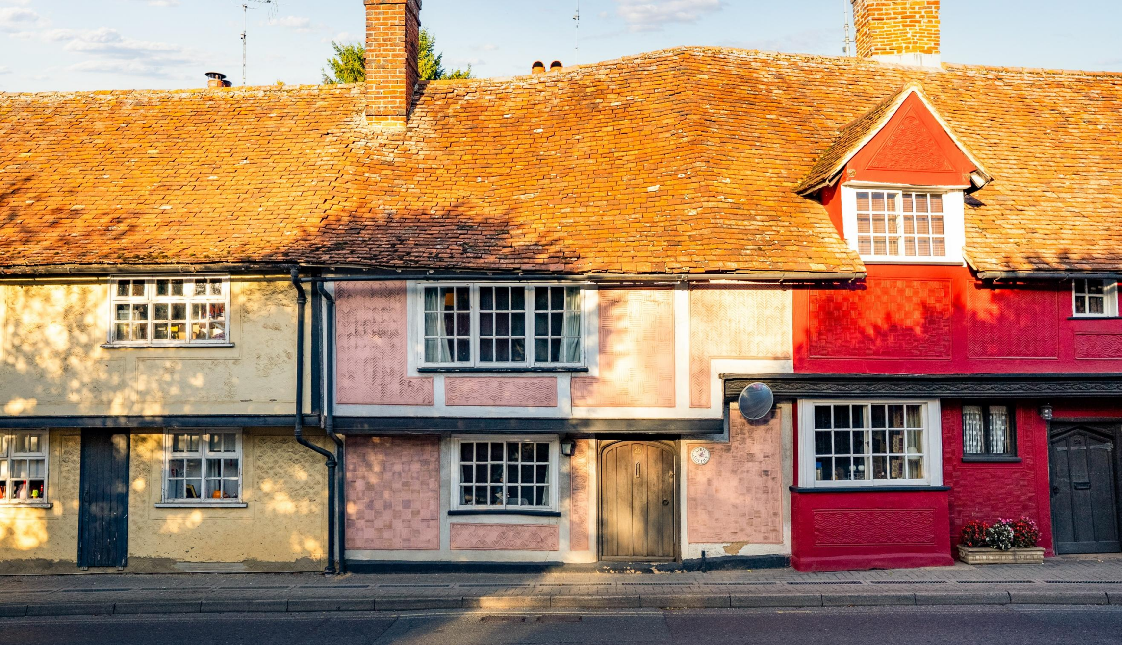
April Cottage, 26 Bridge Street CB10 1BU