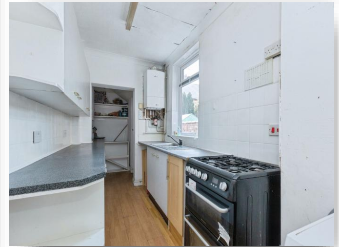
Paget Road, Leicester LE3 5HL