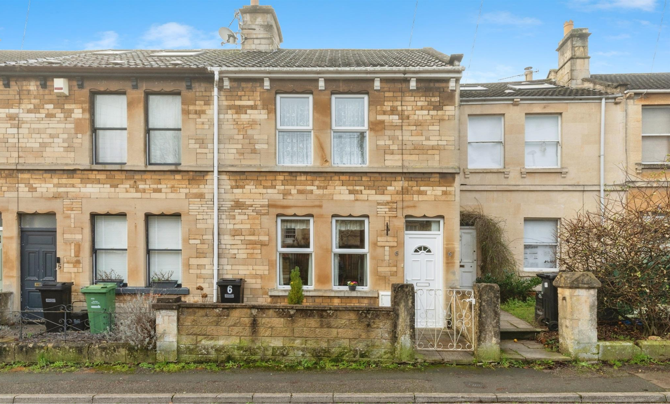
Salisbury Road, Bath, BA1 6QX