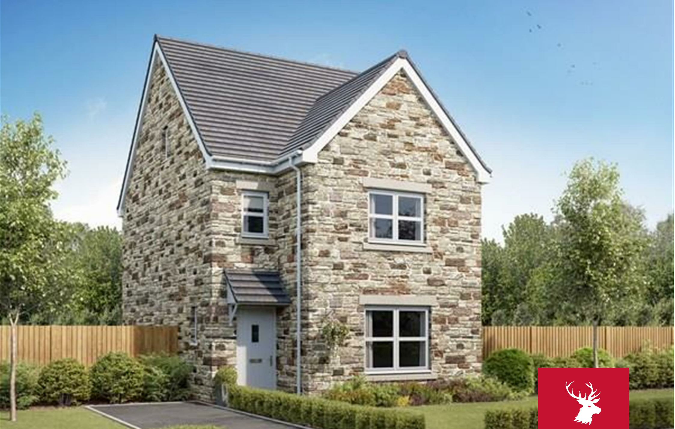
The Greenwood, plot 89