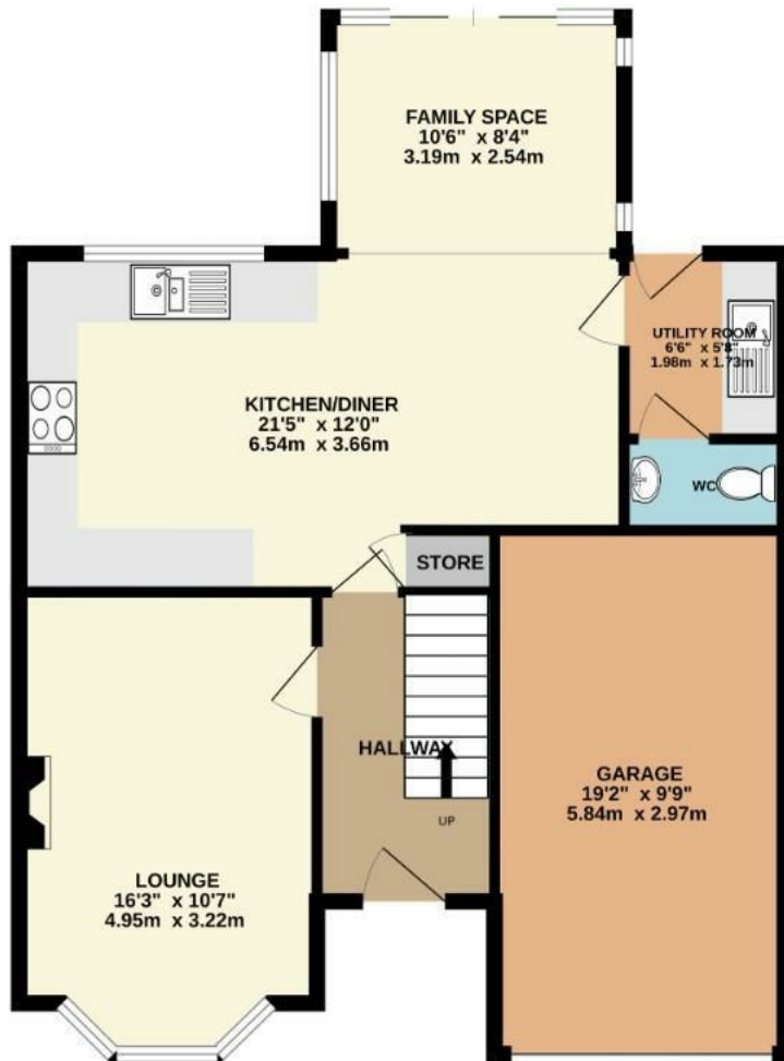
GROUND FLOOR 813 sq.ft. (75.5 sq.m.) approx.