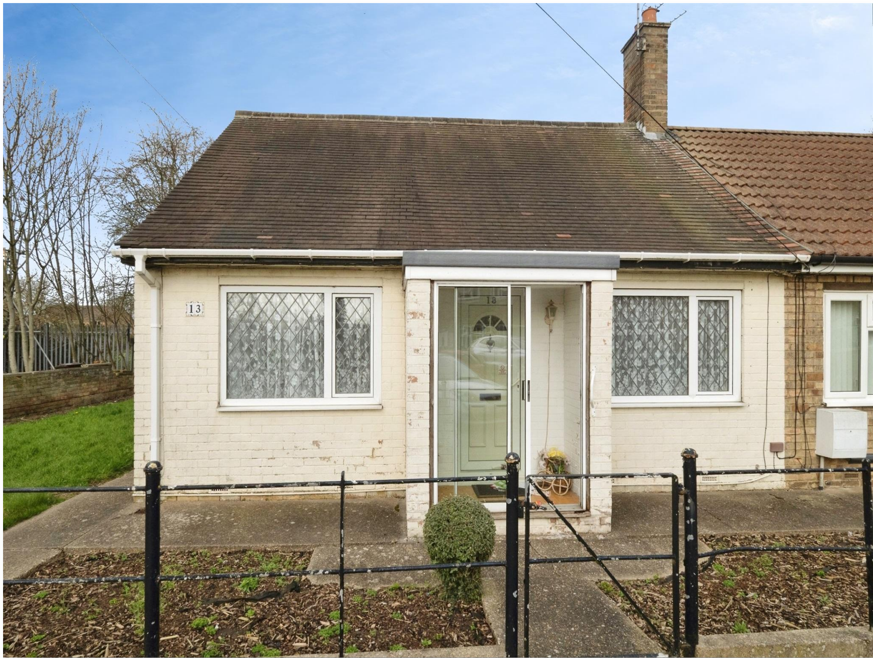
Shevington Walk, Hull, HU8 9QR