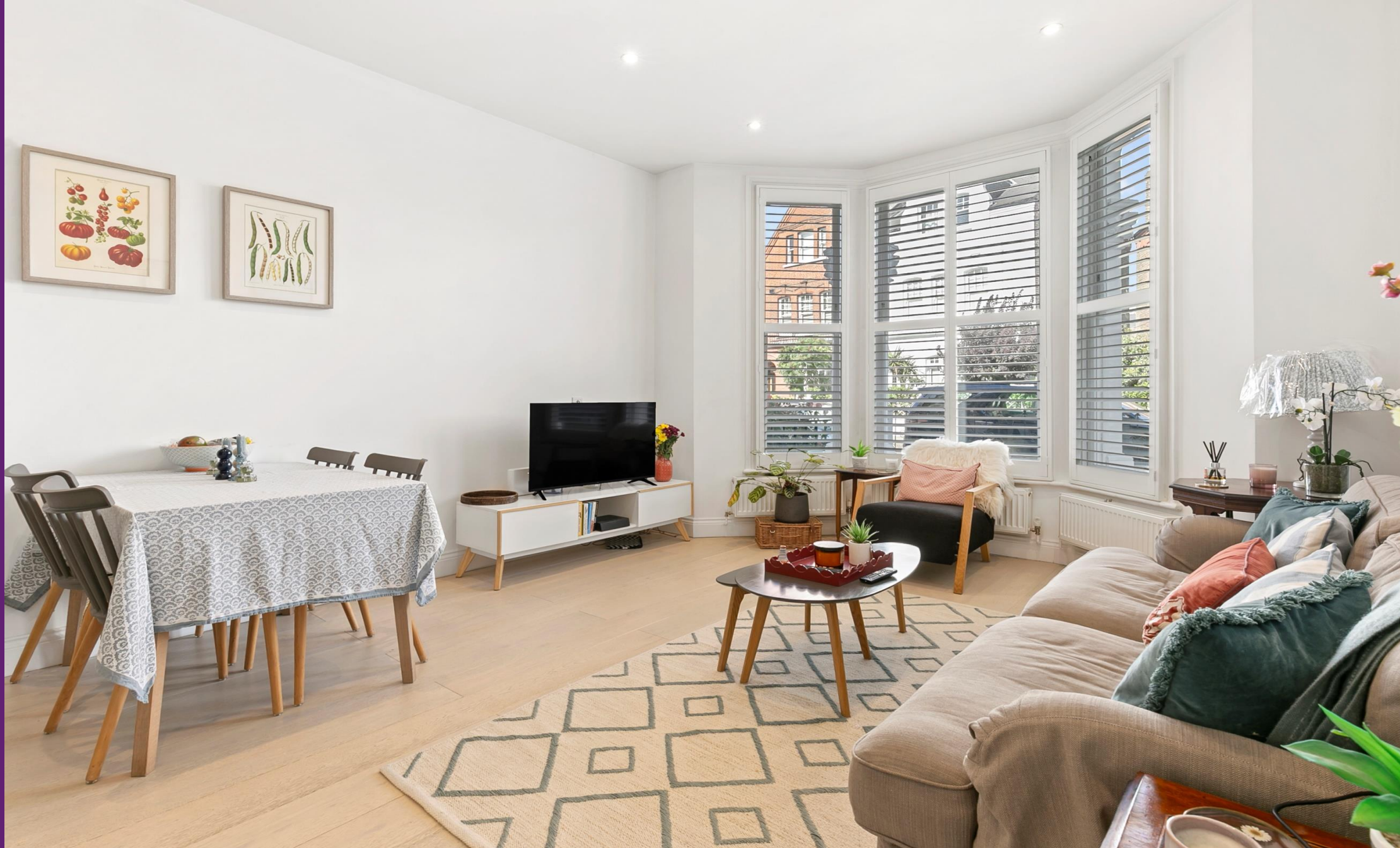
Fulham Park Gardens London, SW6