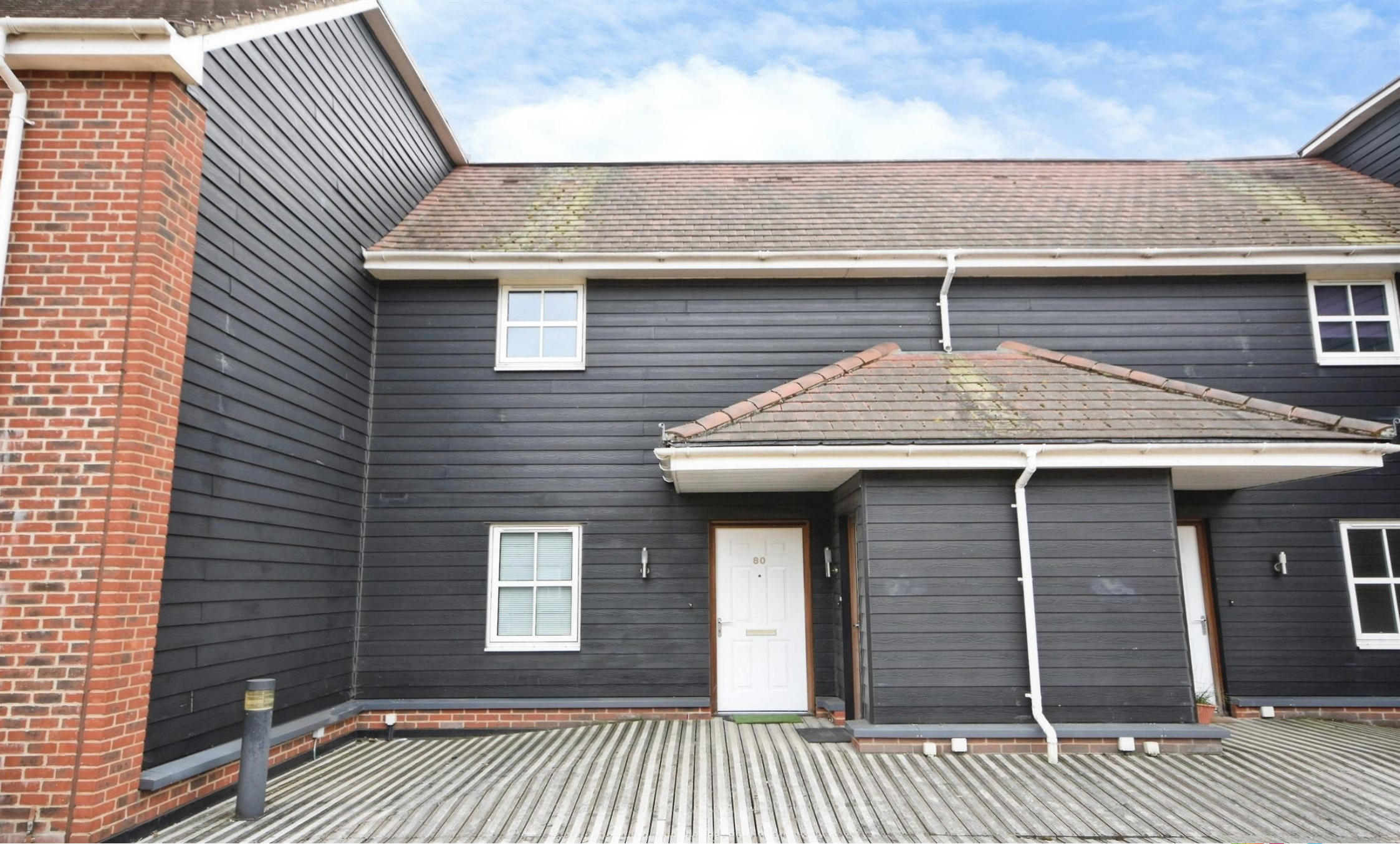
Nayland Court, Market Place, Romford, RM1 3EF