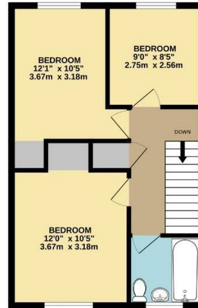
1ST FLOOR 453 sq.ft. (42.0 sq.m.) approx.