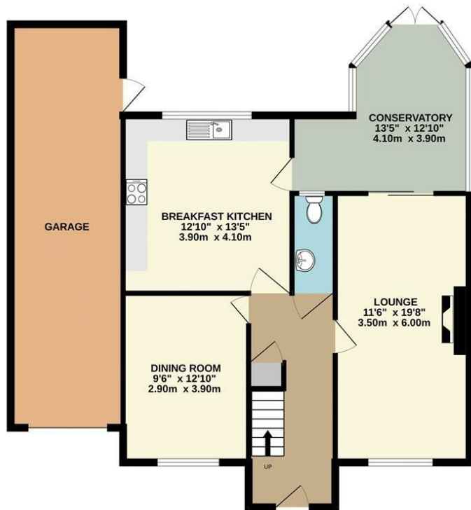
GROUND FLOOR 1016 sq.ft. (94.4 sq.m.) approx.