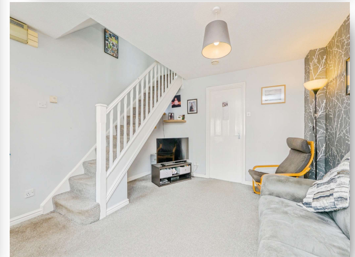
Hind Close, Pengam Green Cardiff CF24 2EF