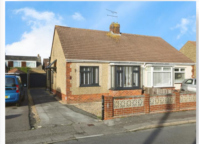
Braemar Close, Gosport, PO13 0YE