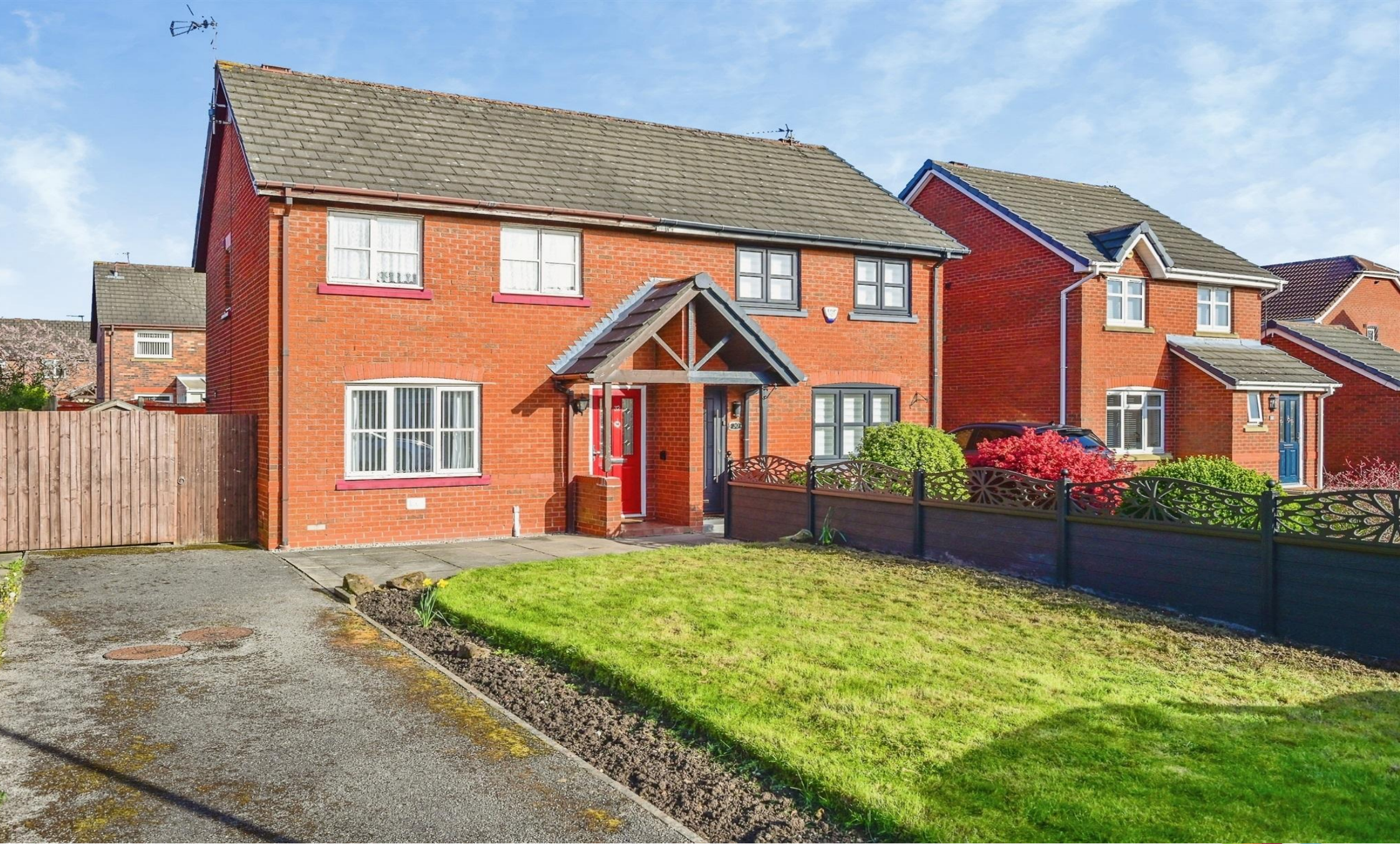
Olive Grove, Wavertree Liverpool L15 8LU