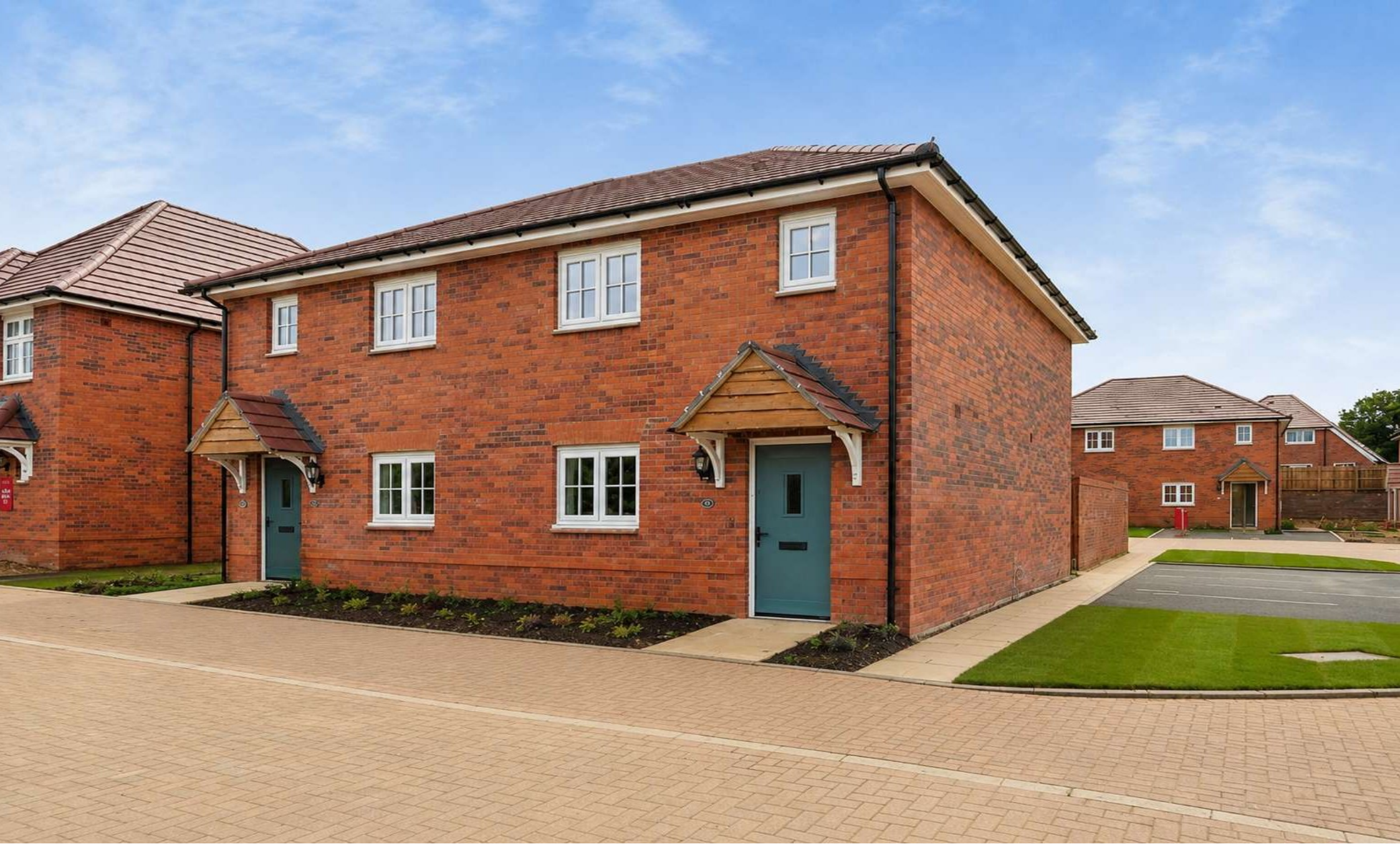
Plot 86 Hazel Park, Stevenage, SG2 7BG