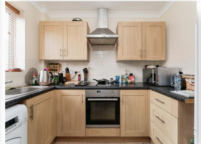
Annabelle Avenue, Manea PE15 0HX