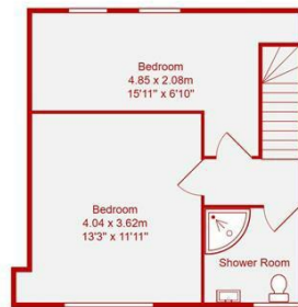
Second Floor Area: 36.0 m 2 ... 388 ft 2