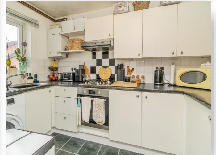
Friary Gardens, Newport Pagnell, MK16 0JZ