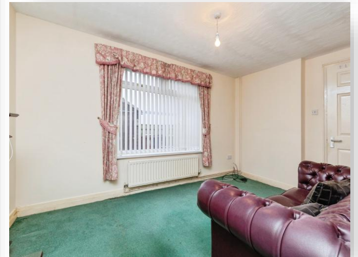
Hilda Walk, Hartlepool, TS24 7ND