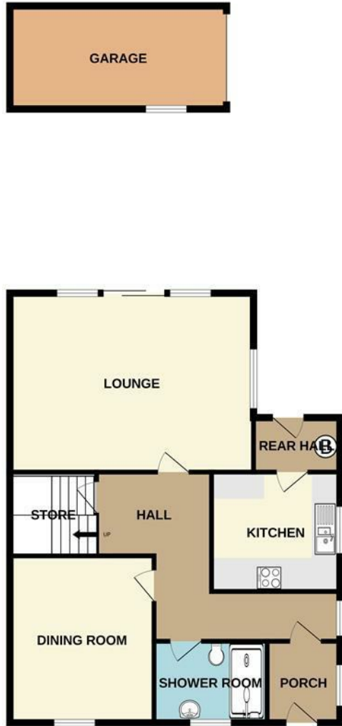
GROUND FLOOR 1008 sq.ft. (93.6 sq.m.) approx.