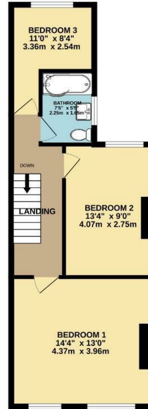
1ST FLOOR 495 sq.ft. (46.0 sq.m.) approx.